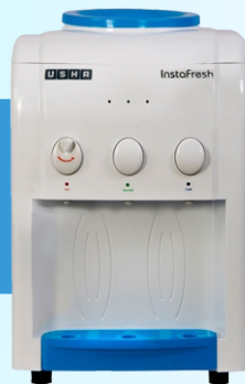
TABLE TOP WATER DISPENSER